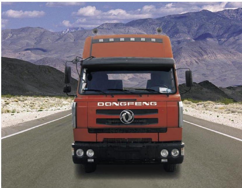
▲ The automatic shift control system was developed for the EQ4195 truck from Dongfeng.

The developed functions were already optimized and adapted to the mechatronic system during the prototyping phase. To implement the model on the TCU equipped with a Freescale MC9S12DT128B microcontroller, fixed-point object code had to be generated. The automatic scaling features of TargetLink were of great help in fine-tuning the fixed-point code. Automatic scaling was a huge time saver as it took away the tedious and error-prone task of manually scaling each variable and each operation in the software. The precision of the scaled code was easily judged by comparing model-in-the-loop