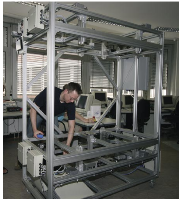
▲ Working on the prototype: The mechanical structure is simple, the control system complex.